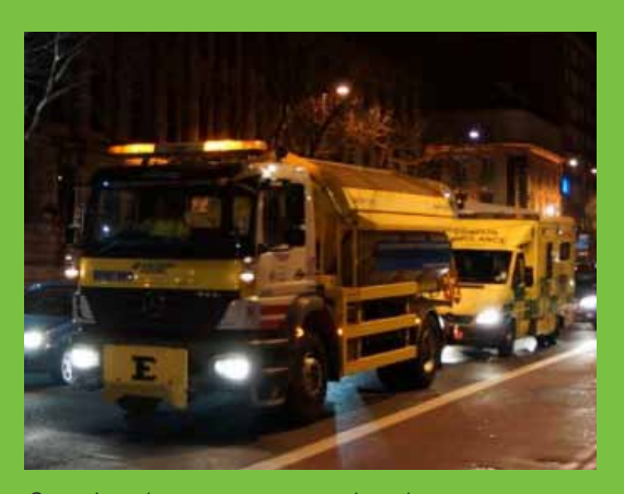
Spraying dust suppressant, London

This formed one of the two grounds in ClientEarth's case (the other being the failure of plans to achieve \mathrm{NO}_2 limits until after 2015). However, a month before the case was due to be heard, the government agreed to settle on this part of the claim and offered to hold a public consultation on the adjusted plan.