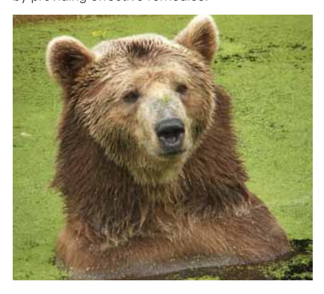
The Slovakian Bears case 93

The Janecek case was not only significant in that it granted the right to clean air - it has significance well beyond the sphere of air quality. This is because it recognised that EU citizens had a right to access national courts to uphold EU laws which were in place to protect human health had been. Interestingly this right did not derive from the Aarhus Convention, but from broader principles of EU law: namely that national courts must give effect to EU law rights by providing effective remedies.