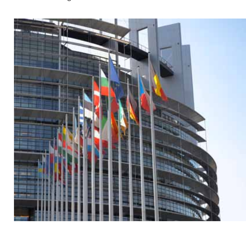
European Parliament, Strasbourg

However, there have now been several cases where NGOs and citizens have overcome these problems and gone to court to successfully defend their right to clean air.<sup>46</sup>